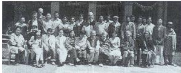
School teachers & students

Language School was hard work: I had four individual lessons daily, all with different teachers, and in the free periods in between there was plenty to do learning vocabulary, practising Model Sentences, reading and writing exercises. But by the end I had taken my Third Progress Evaluation, and was told that I was making good progress. The other students, all mission people, were from many countries: Colombia, Argentina, China, Korea, USA, Germany, Holland and Finland ... so we usually conversed in Urdu at mealtimes. We had devotions in English and Urdu on Monday and Friday, and on Sundays we could go to Murree Christian School (an international boarding school for missionary children) for English worship, or in Murree town to Holy Trinity (Church of Pakistan) or St Margaret's (Presbyterian) for their Urdu services.