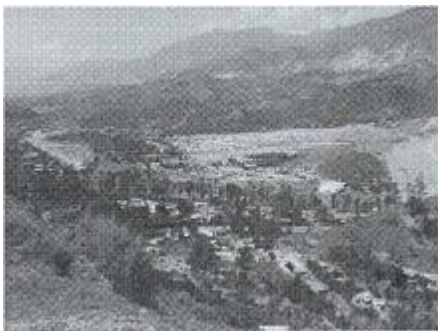
Kunhar Christian Hospital