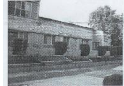
Bach Christian Hospital

For my "half-term holiday" (at the end of June) I arranged to visit two mission hospitals in this area, Bach Christian Hospital in Qalandarabad, North West Frontier Province and Kunhar Christian Hospital in Ghari Habibullah, near Muzaffarabad. Both were front-line hospitals during the earthquake emergency and are still involved in various rehabilitation projects.